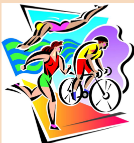
Swim - Bike - Run

Individual or Relay - Challenge Yourself!